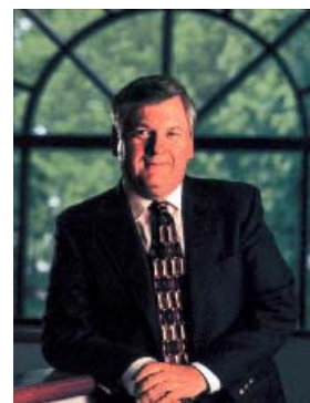
David Bernd CEO Sentara Healthcare

(Alumni/ae Spotlights continued on page 5)