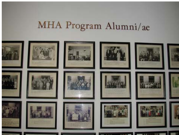
Above: MHA graduating class pictures and below: MSHA graduating class pictures on the Grant House's second floor.