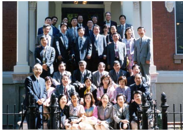
Picture from MGMA Event