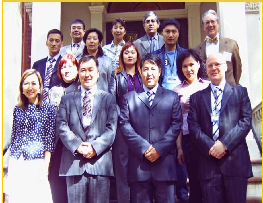
Kazakhstan Associates from Kazakhstan ministry of Health.