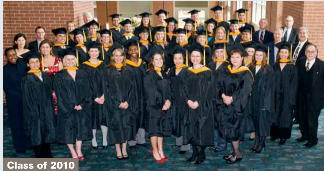
Class of 2010