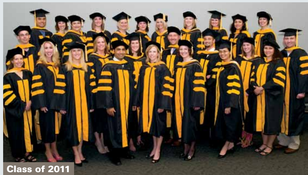
Class of 2011

*Faculty **Chairman *Dean, VCU School of Allied Health Professions ♦Emeritus